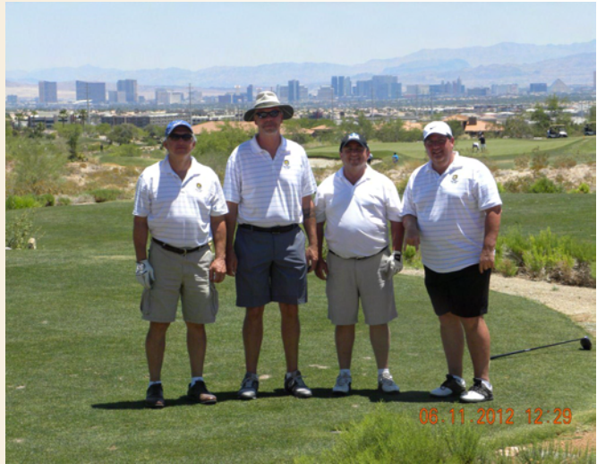
A mighty foursome taking in the scenery.