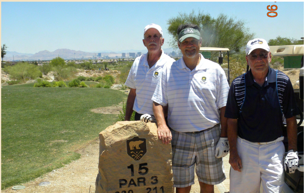
Taking on the challenge at Bear's Best!