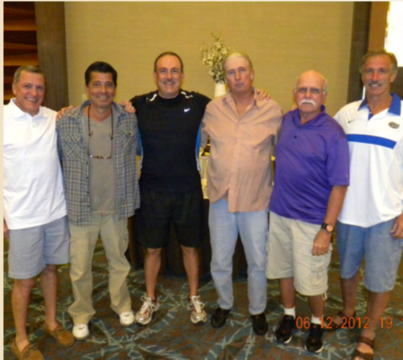
Enjoying this year's Banquet!