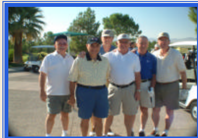
"The Philadelphia Connection" They've returned from last year!