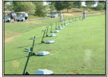
Primm's Driving Range