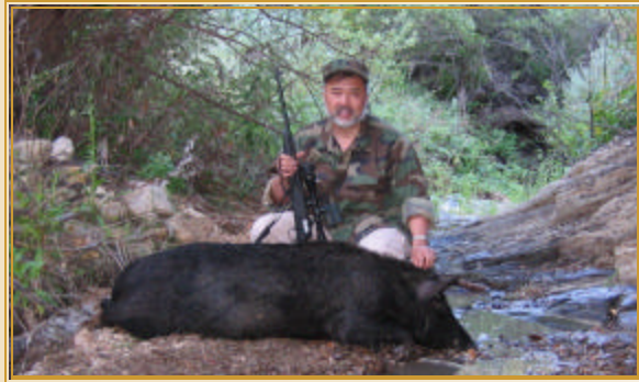
Do you feel lucky today, Pig?...Inspector Gin