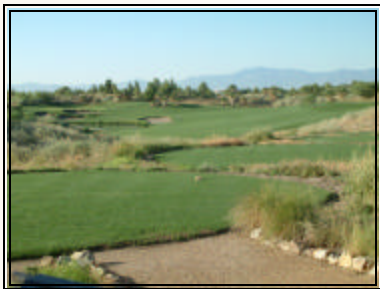
Overall Winners Desert Course