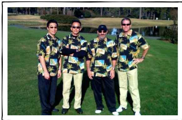
Picture of the ALSRI members participated in the IRS East Coast event in Myrtle Beach back in 2007 donning an unusual golf attire bought at Tommy Bahama Store prior to the event. They called themselves, "The Bahama Boys."